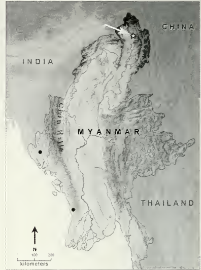
FIGURE 4. Distribution of Rhacophorus htunwini sp. nov. in Myanmar with type locality indicated by a star (at tip of arrow).

The type specimens including the holotype (CAS 229913, USNM 561869) were found approximately 2 m off the ground in bamboo. Referred specimens were found in undisturbed habitat near a spring (CAS 222136) or seasonal (CAS 221351) and permanent (CAS 222065) streams. Other species of Polypedates and Rhacophorus found in the vicinity of the type locality were P. leucomystax , R. bipunctatus , and R. dennysi .